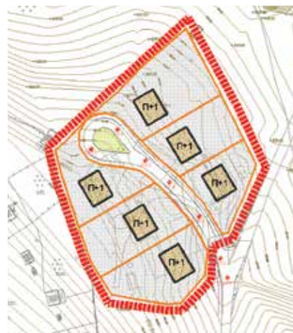
Master plan of "Kula-Rudići Business Zone"