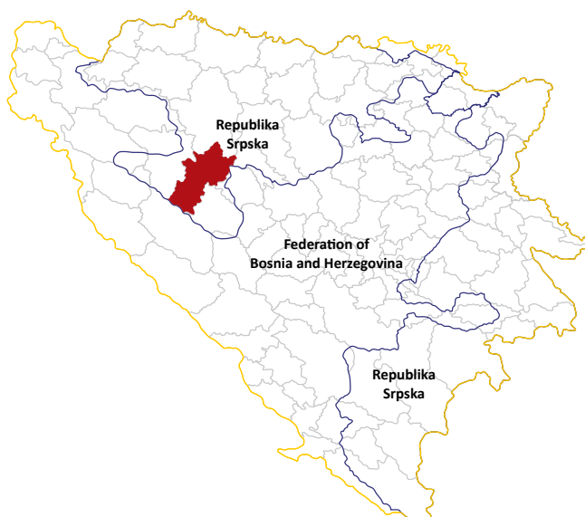
Mrkonjić Grad in Republika Srpska (RS) and Bosnia and Herzegovina (BiH)

Mrkonjić Grad Municipality is located in the northwestern part of Bosnia and Herzegovina (BiH), in Republika Srpska (RS).