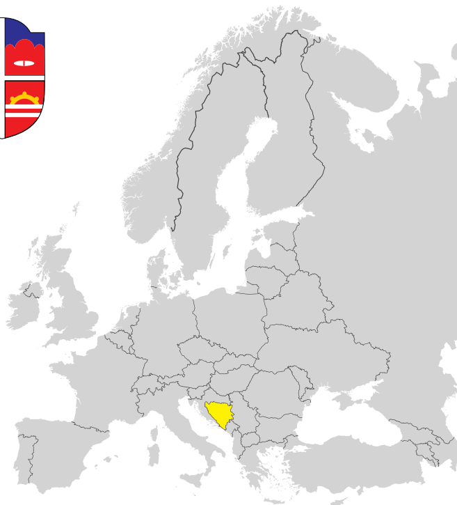
Bosnia and Herzegovina in Europe